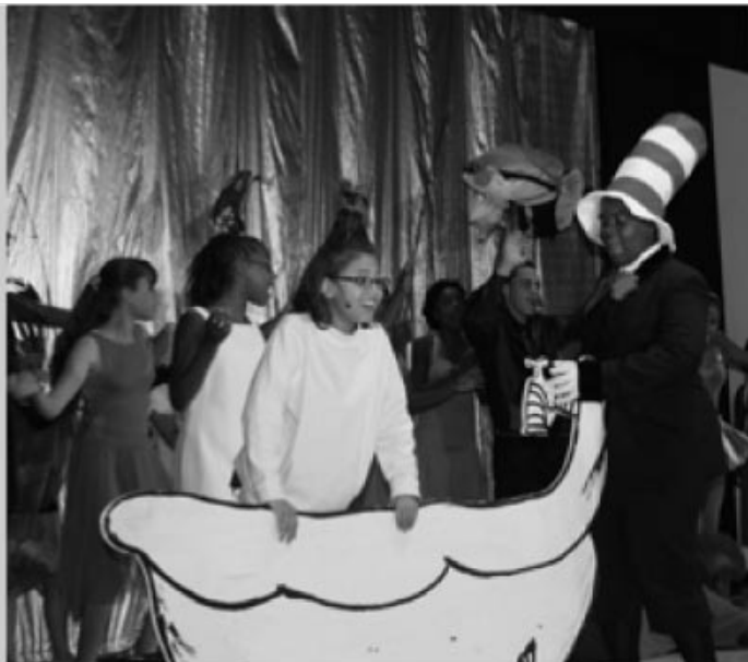
Scene from "Suessical, Jr." 2008