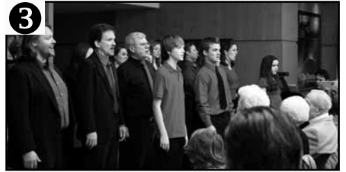
2 Female cast members harmonize on a lovely Broadway favorite. 3 Male performers entertain the Reading Public Museum's guests at "Bagels & Bach".