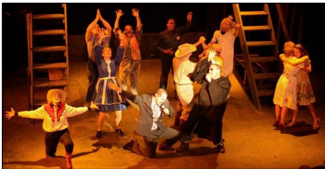
Bat Boy, The Musical June 2011

$25 renewals are still welcome, but we love donations!